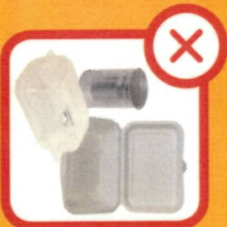
Styrofoam, Plastic, Glass, Metal, Tetra Pak or Foil Food Containers