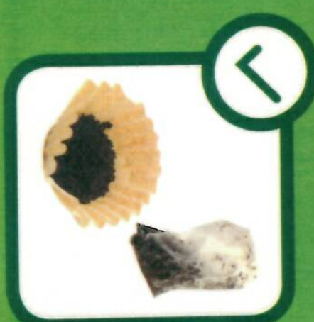
Coffee Filters, Coffee Grounds & Tea Bags