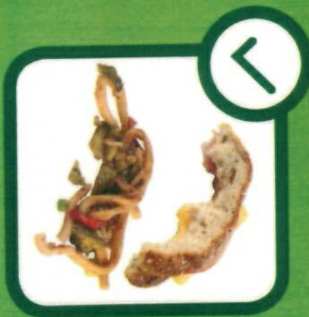
Noodles, Pasta, Grains & Bread