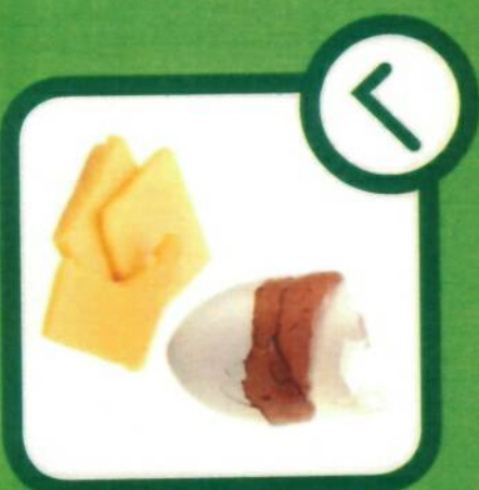
Eggs & Dairy