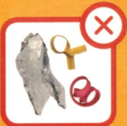
Twist Ties, Elastic Bands & Plastic or Foil Wrappers