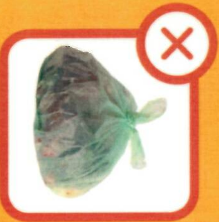
Plastic Bags (Including compostable or biodegradable)