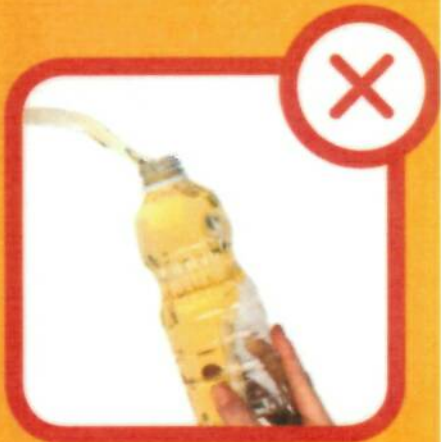
Oil, Grease & Liquids