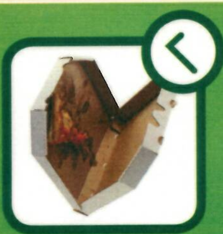
Used Pizza Boxes