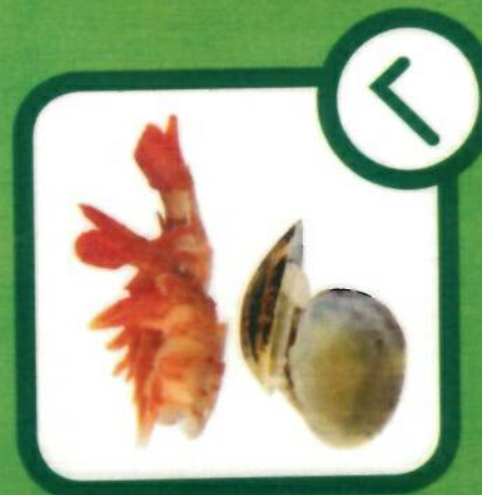
Fish, Seafood & Shells