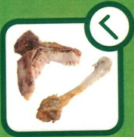
Meat & Bones